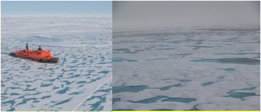
Figure 3: Photographs of linked melt ponds typical on level first year ice (left) and discrete melt ponds on older ice (right).

Sea ice stage of melt can be characterized in a 5 point scale (table 1) that follows the WMO standard convention for describing melt. In North American ice charting this scale is reproducible from the standard observations (Canadian Ice Service, 2005) outlined in table 2. In ASSIST the full 5 point scale can be reproduced provided all melt fields are entered for an ice type. The pertinent information is whether thaw holes are present in melt ponds, if ice has dried or become rotten and whether ponds are freezing over. In addition to the stage of melt information, area of ice covered by melt pond and pond characteristics, such as whether melt ponds are discrete or linked (see figure 3) and the depth of melt ponds can be recorded.